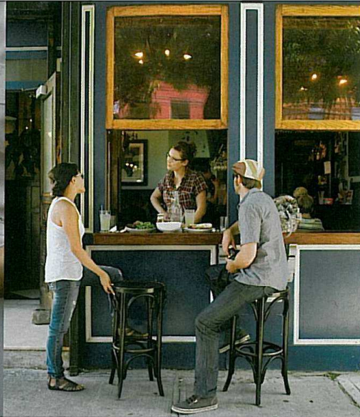
Clockwise from above, a brick-oven pie from Roberta's; the open-window policy at Fort Defiance; frosted carbs from Smorgasburg; the Williamsburg Bridge.