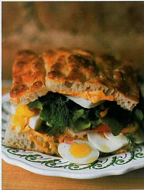
No matter what you order, you'll leave the nautically themed Williamsburg sandwich shop Saltie with a full stomach, so you might as well go big: The Scuttlebutt, above, is stuffed with feta, hard-boiled egg, and pickled vegetables.

Saltie Williamsburg You're here for the Ship's Biscuit—scrambled eggs and fresh ricotta on cloud-fluffy focaccia.